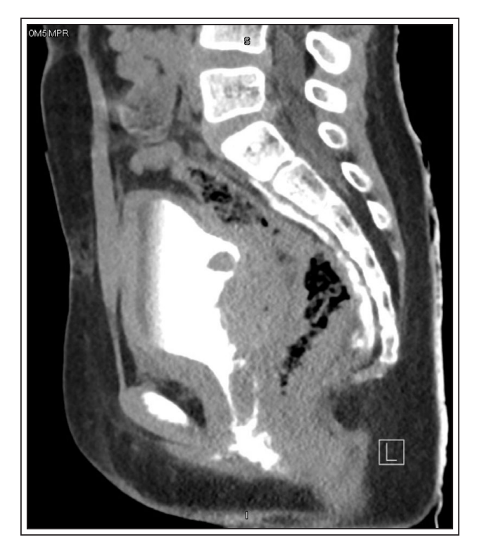
Figure 1. Disruption at the base of the bladder in the region of the bladder neck with contrast extravasation.

Cystoscopy was attempted. The distal one centimeter of the urethra was intact, but the proximal urethra and bladder neck were obliterated and widely open, therefore an open exploration was performed. There was a fourcentimeter laceration through the posterior bladder neck, which extended in a V-fashion along either side of the trigone. The ureters appeared to be uninvolved. The bleeding was cauterized, and Surgicel was placed along the left floor of the bladder. The floor of the bladder was then reapproximated and sutured to reconstruct the trigone and bilateral ureteral stents were placed given proximity to the laceration. The bladder neck was then approximated around a catheter through the bladder