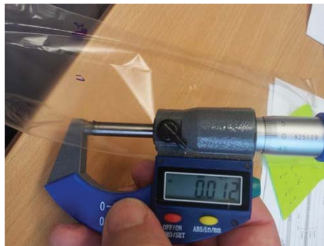
Figure 3 Thin extruded thermoplastic starch film at 12 micron produced at The University of Queensland.

There is a lack of understanding of processing starch films at low gauge (under 50 microns), as well as the subsequent relationships of processing–structure–properties of these films. A range of film properties such as pH resistance, bacterial resistance, temperature resistance, barrier resistance and changes in these properties over time, have also not been explored.