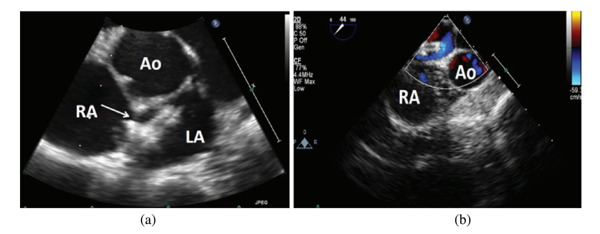
Figure 2: Transthoracic echocardiogram parasternal short axis view 11 months after 25 mm GORE CARDIOFORM Septal Occluder implantation (a). Note that the device has prolapsed into the left atrium and a residual defect (arrow) is now apparent. Transesophageal echocardiogram at time of surgical device removal and ASD patch closure (b). Note misalignment of device with septum and aortic root and residual left to right shunting as demonstrated by blue flow. Ao = aorta; ASD = atrial septal defect; LA = left atrium; RA = right atrium

Four months after surgery, the patient remained well and TTE demonstrated normalized right heart size without residual defect.