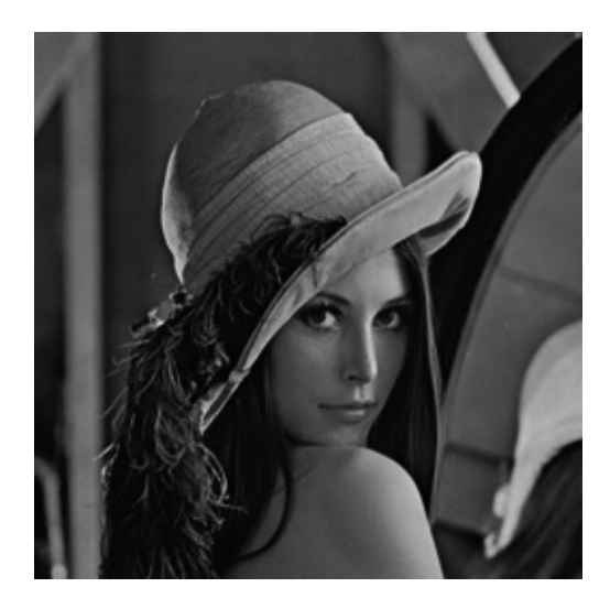
Figure 3: Leena image used as cover image to hide secret information

of a sector depends on the number of sectors. Each sector is allocated a number i.e. the number of bits to be substituted. As DCT coefficient in double format have a bits depth of 16. Therefore, the IDIBS algorithm can assign 0 to 16 bits to sector, and can used for data hiding. Here, different number of sectors and number of bits allocation is used for experimentation and the results are generated and demonstrated at appropriate place in the paper. For experimentation image of Leena is used as a cover media, as shown in Fig. 3.