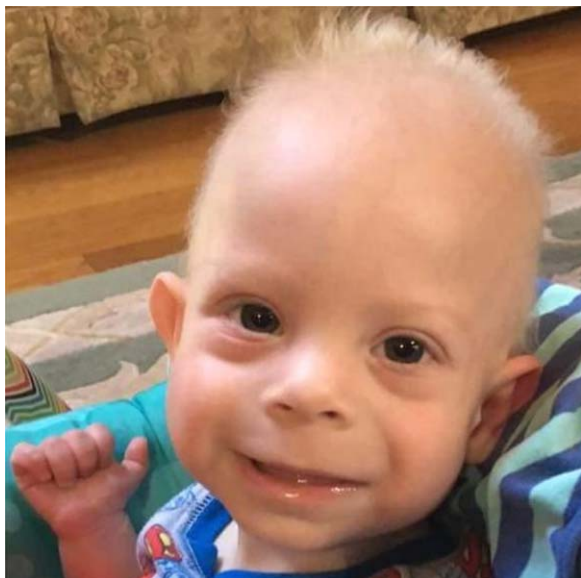
FIGURE 1 Subject C, at 15 months, demonstrating the characteristic SLOS facial features of bitemporal narrowing, hypertelorism, short nasal root, broad nasal bridge and base, anteverted nares, smooth long philtrum, and a small chin. Also notable is the short, proximally placed thumb. Parental consent was obtained for publication of this photograph.

stenting. 6-8 More recently, drug therapies have been attempted to delay disease progression and to treat the intimal proliferation within the vessels. 9,10 Many of our more recent PVS patients have been enrolled in a 48-week open-label FDA-regulated trial of imatinib mesylate with or without bevacizumab. 11 Despite intervention, many patients experience both recurrence of disease (restenosis in a location with prior disease) and progression of disease (stenosis in new vessels, longer distal stenotic segments of previously diseased vessels, or complete venous atresia). 12 In many cases, PVS is an end-stage condition, with mortality rates of up to 83% in patients with 3 or more stenosed veins. 13 Another study notes a 2-year survival rate from diagnosis of 43%, but only 25% survival in children who underwent transcatheter interventions. 1