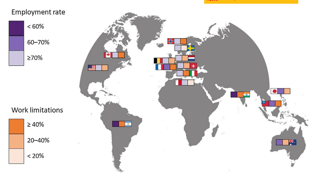
FIGURE 2 Distribution of employment and work limitations (work limitations among employed patients) among participating countries. This map shows the amount of employment and work limitations per country, with darker colors reflecting less unemployment and more limitations. Participating countries with total number of participants and percentage employed: Argentina (N = 174, 52% employed), Australia (N = 132, 67%), Belgium (N = 275, 80%), Canada (N = 517, 75%), France (N = 95, 63%), India (N = 199, 43%), Italy (N = 64, 74%), Japan (N = 257, 67%), Malta (N = 116, 74%), Norway (N = 172, 70%), Sweden (N = 468, 73%), Switzerland (N = 276, 72%), Taiwan (N = 250, 64%), The Netherlands (N = 254, 70%), and United States (N = 744, 70%)