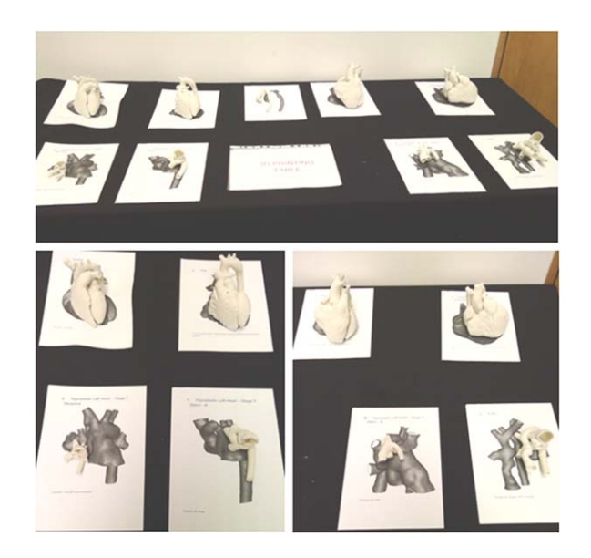
FIGURE 1 Models were displayed on a table outside the lecture theatre and nurses were invited to explore their features during the course. Labels included a 2D image of the model itself, the name of the defect being depicted, as well as the age and sex of the patient

and recommendations. The first three questions focused on the learning experience and information elements of the models and were answered on a 5-point Likert scale (1-strongly agree to 5-strongly disagree). The fourth question addressed potential attributes of the model in terms of facilitating understanding, asking nurses to indicate, by ticking if applicable, whether they agreed with a series of statements (e.g., 3D patient-specific models helped me to appreciate anatomical complexity of repaired CHD) and the final question asked participants to rate all nine models on a 7-point Likert-scale from 1 = "not useful at all" to 7 = "extremely useful." Finally, an option was given to leave additional feedback.