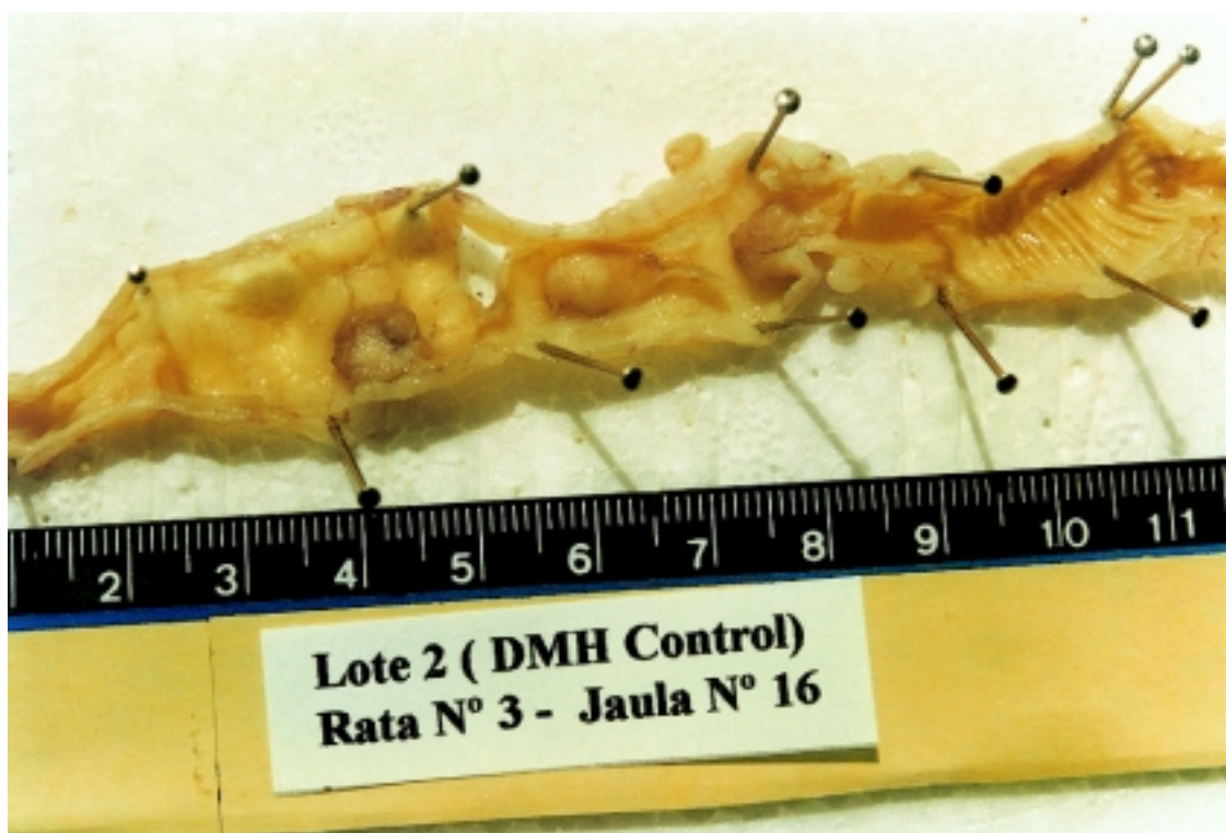
FIGURE 1. Multiple tumors in the distal colon and the proximal colon of an animal treated with DMH and observed for 26 weeks after the first application of carcinogen.

The frequency of polypoid and nonpolypoid growth is shown in Table 2. The CM group had more polypoid sessile tumors, whereas the BM group and the DMH alone group had more flat tumors.