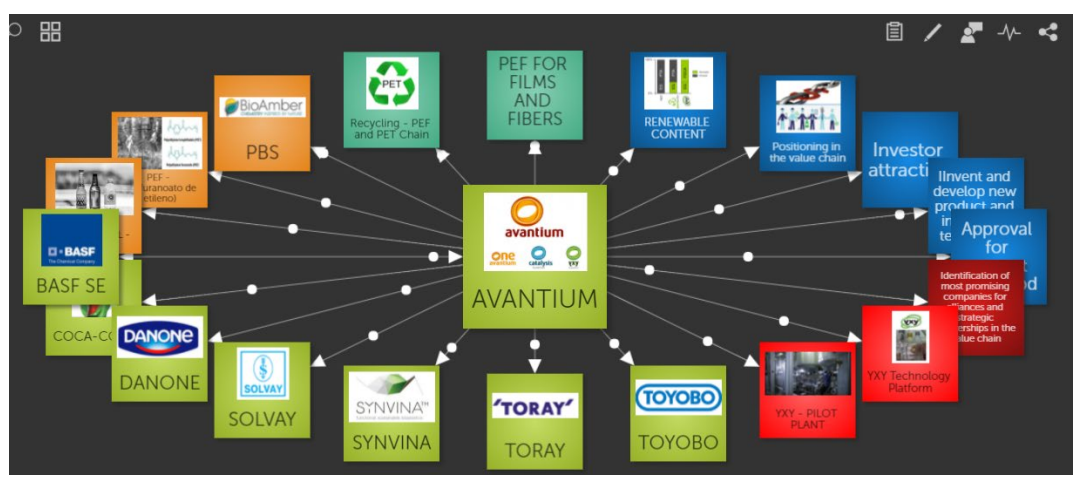
Figure 2: Avantium analysis of the relational with drivers, technologies, properties and in partnership with other players

The potentiality of the process established in this work, could be observed by the proposed relational information showed in Figs. 2 and 3 that highlights examples of the possible relationships for a company (Avantium) and for a biopolymer (Green Polyamide), respectively.