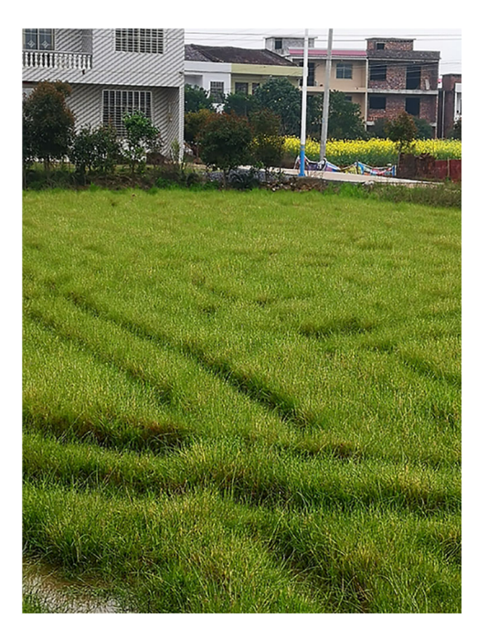
Figure 1: Fallow weeds dominated by Japanese foxtail ( Alopecurus japonicus Steud.) in a rice field nearby the famer's house in Anren County, Hunan Province, China.

( Astragalus sinicus L.), during the winter season is a traditional practice used in rice production in China due to its benefits of improving soil fertility [10]. However, because rapid urbanization has led to a labor shortage and an increase in labor wages in rural areas of China, many Chinese rice farmers have had little enthusiasm to plant green manure crops [11]. As a result, the planting area of green manure has sharply decreased since 1970s [12], and more and more rice paddies are left fallow during the winter season [13]. These winter fallow paddies provide a huge opportunity for the occurrence of weeds (Fig. 1).