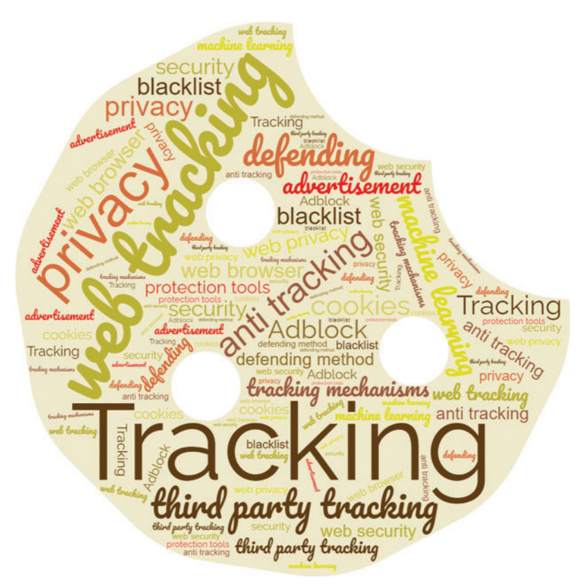
Figure 2: Keywords of the selected papers using a word cloud

The keywords of the selected papers using word cloud are presented in Fig. 2. Furthermore, Fig. 3 shows the method used for the data extraction process.