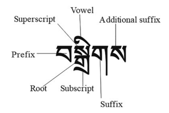
Figure 1: Tibetan syllable composition