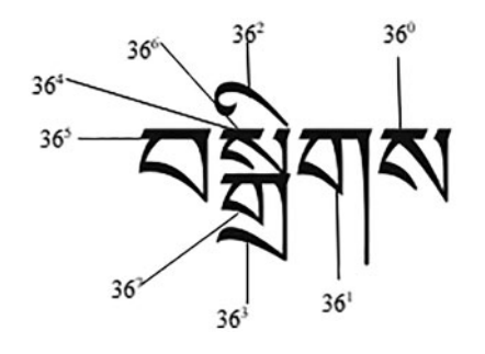
Figure 4: The distribution of position weights of Tibetan script components