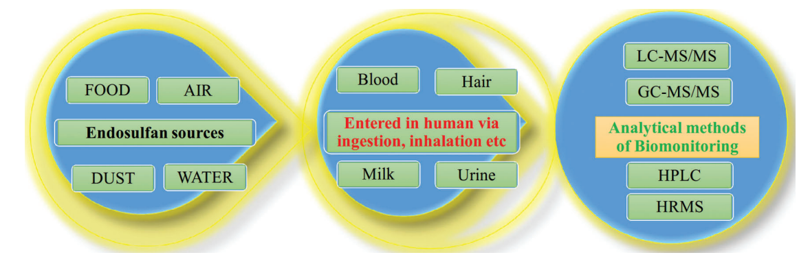
FIGURE 3. Flow of toxic endosulfan from the environment to humans and their biomonitoring using OMICS and other analytical methods.

Endosulfan instigated modifications in serum biochemical markers of oxidative stress in rabbits. It was suggested that vitamin C supplementation could also be helpful to keep the upcoming impacts of expanded aerobic pressure caused by endosulfan exposure (Ozdem et al., 2011). Endosulfan might repress cholinesterase movement in vitro and in vivo in Wistar rats and cross the placental boundary and influence the catalyst movement in male rodents (Silva and Carr, 2010). Regarding its neurotoxicological system of activity, endosulfan meddles with the capability of y-aminobutyric corrosive (GABA: the primary neurotransmitter inhibitory). It restrains the authority of [35S]t-butylbicyclophosphorothionate (TBPS) to the picrotoxinin-authoritative site of the gammaaminobutyric acid receptor in rodent brain synaptic films, interfering with chloride particle motion through the GABA-gated chloride channels (GABAA) in charge of diminishing neuronal volatility (Walse et al., 2003). Above discussed studies provide evidence that endosulfan toxicity is not only limited to one generation but also shows side effects in the next generation. Thus, endosulfan chemicals may be responsible for causing the genetic disorder. Hence endosulfan requires more study to find out the relation in the genetic disorder of humans.