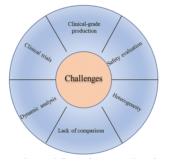
FIGURE 2. The main challenges of exosomes in the application of regeneration medicine.

In addition to the obstacles mentioned above, there are still the following challenges about the application of exosomes in regenerative medicine. In a number of studies, lack of comparison of the therapeutic effects of "MSCs"