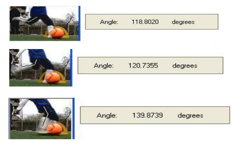
Figure 2: Successive video frames used for geometrical measurements

In order to determine these kinematic parameters, the videographical method was used, using a camera with normal recording. Then, using specialized programs of decomposition into separate frames (frame by frame) and of measurement of the angular or linear values, there were determined the kinematic parameters by the ratio between the angular or linear variation and the time variation between two successive video frames. Thus, in figure 2 there are represented a few successive frames used to angular measurements between thgih and shank for a junior football player during a direct free hit.