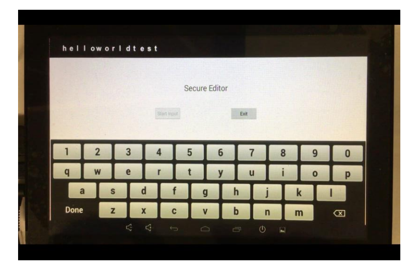
Figure 3: Snapshot of SecEditor based on the SecDisplay